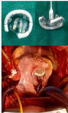
Figure-1: Intraoperative images showing Medtronic Contour 3D ring. Image depicting 2-dimensional profile of the ring (1), image depicting 3-dimensional profile of the ring (2) and post implantation image, surgeon's view (3).

Patients were either traced from routine OPD (out-patient department) follow-up or telephonically from the mobile numbers provided in the admission papers. Post-operative transthoracic echocardiography was done to assess any residual TR (tricuspid regurgitation) and patients were clinically assessed using NYHA (New York Heart Association) functional classification. TR was graded as 0 (no TR), 1 (mild TR), 2 (moderate TR) and 3 (severe TR). Average duration of follow-up for all patients was 5.6 ± 2 months (3-10). Follow-up was 94% complete till date.